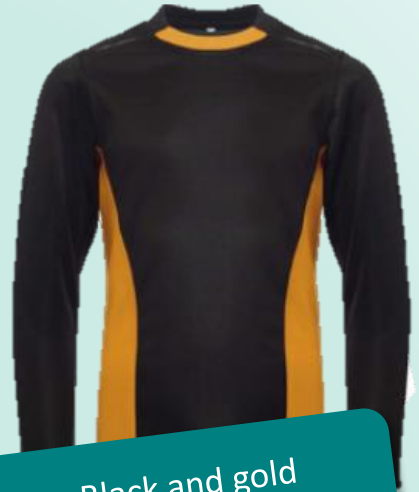
Black and gold multisport top