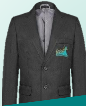
Saltash School blazer

There are no major changes to our uniform policy from previous years, but as we strive for excellence and equity, we will enforce our policy with 'no excuses' to ensure that we hold every student to the same high standard. Tutors will check uniform at line up each morning. Please support us in setting the tone by ensuring your child comes to school in the correct attire.