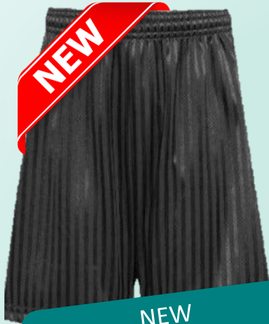
NEW Loose fitting, black PE shorts (not lycra.)

There are no major changes to our uniform policy from previous years, but as we strive for excellence and equity, we will enforce our policy with 'no excuses' to ensure that we hold every student to the same high standard. Tutors will check uniform at line up each morning. Please support us in setting the tone by ensuring your child comes to school in the correct attire.