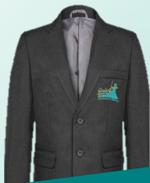
Saltash School blazer

There are no major changes to our uniform policy from previous years, but as we strive for excellence and equity, we will enforce our policy with 'no excuses' to ensure that we hold every student to the same high standard. Tutors will check uniform at line up each morning. Please support us in setting the tone by ensuring your child comes to school in the correct attire.