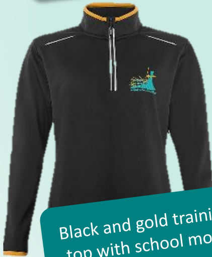
Black and gold training top with school motif