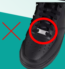
Black, flat- heeled, polishable school shoes- NO TAGS!