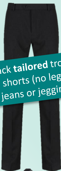
Black tailored trousers or shorts (no leggings, jeans or jeggings.)