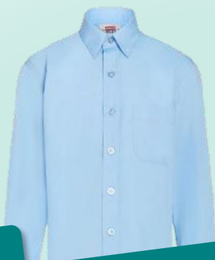
Blue shirt or blouse