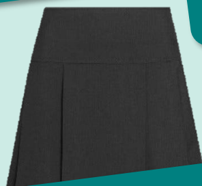
Black drop waist pleated skirt